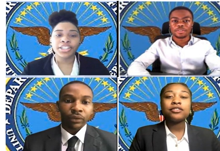
Pictured Above: DoD Summer researchers presenting during the virtual 2021 HBCU/MI Research Symposium.